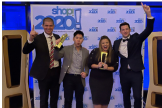
Nestle and CHEP win GOLD SHOP! Association Award